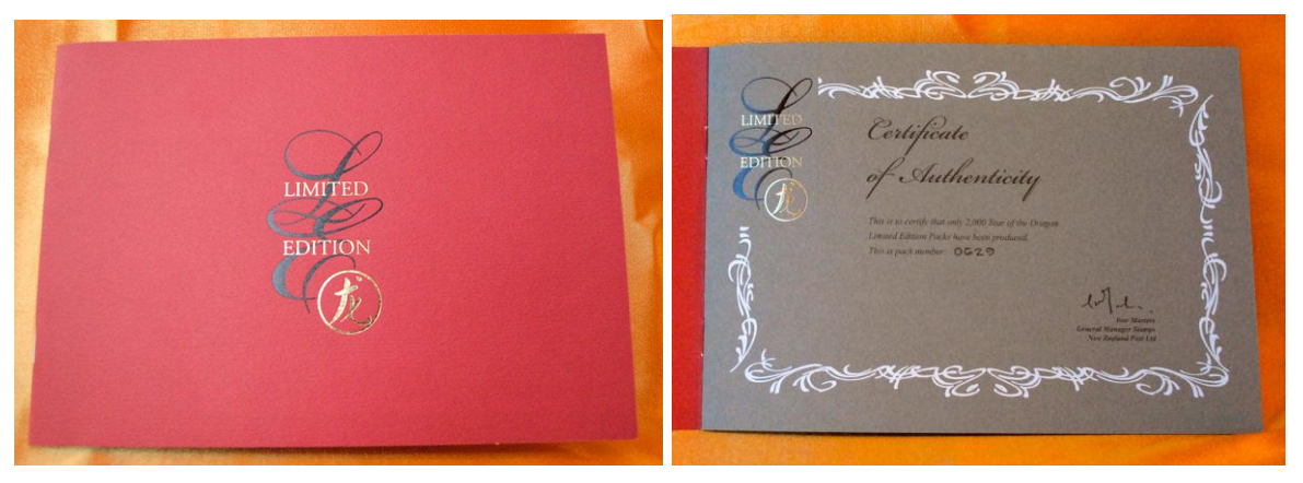
The certificate of Authenticity contents:

5. A delicate bilingual booklet which includes: The certificate of Authenticity with the unparalleled number of this collection; Stamp issue summary; Messages from the creative team leader; Introduction of the zodiac especially dragon culture; Each stamps creative concepts and the booklet's author profile. Each stamp pages feature a set of gummed plate block which contains some interesting information of the stamp, e.g. The stamp designer, printer, the process color markers of the character "dragon".